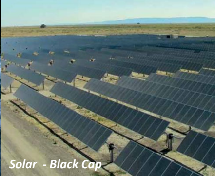
Solar - Black Cap