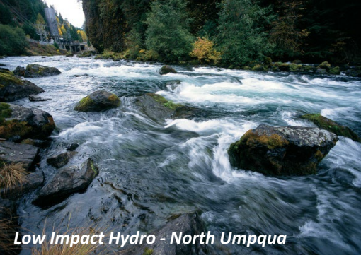
Low Impact Hydro - North Umpqua