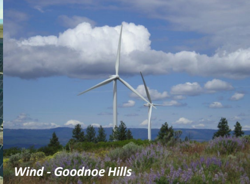
Wind - Goodnoe Hills