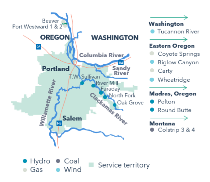
Figure 2: PGE's Service Territory

For more information, see PGE's website: www.portlandgeneral.com.