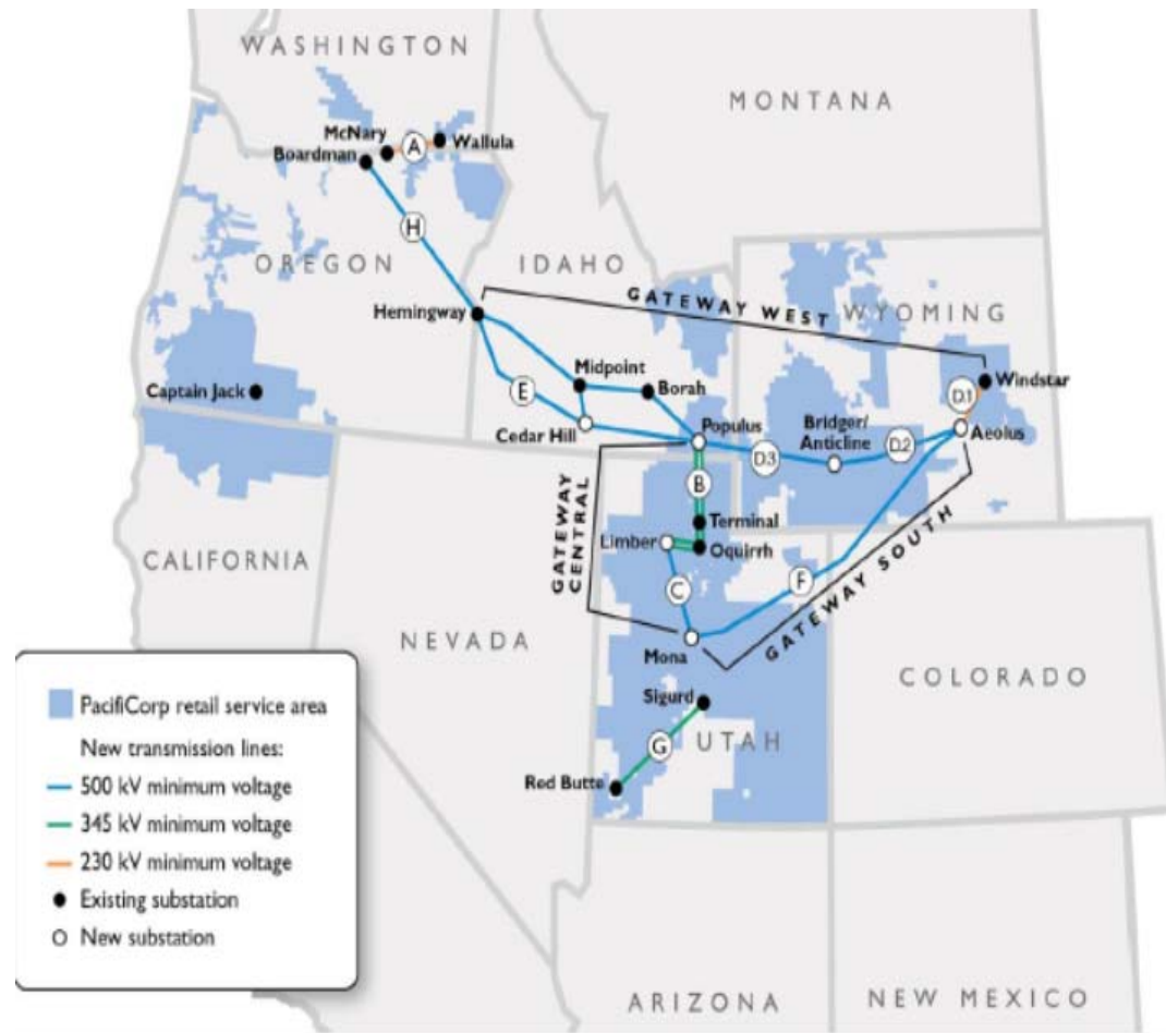
This map is for general reference only and reflects current plans. It may not reflect the final routes, construction sequence or exact line configuration.