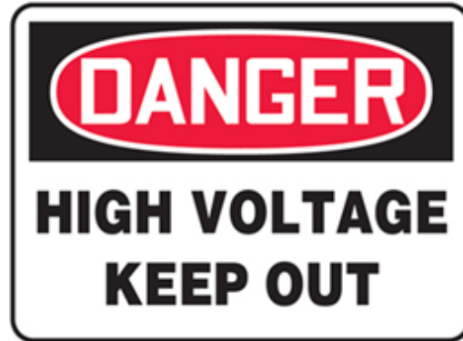
Figure 2.1. Example Warning Sign

P. Owner signage shall be provided at all gate entrances.