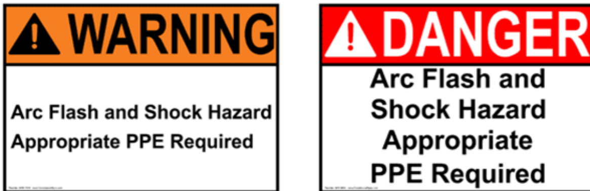
Figure 2.2. Example Arc Flash Hazard Warning Labels