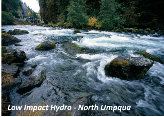
Low Impact Hydro - North Umpqua